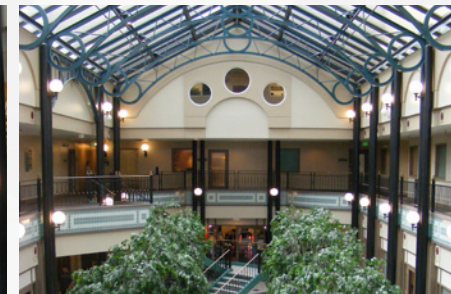
ENTRY / ATRIUM / COMMON AREAS